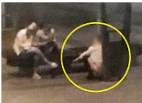
Shocking CCTV image shows the