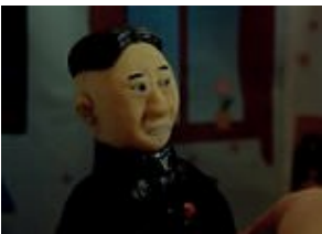
North Korea 'try to intimidate British-