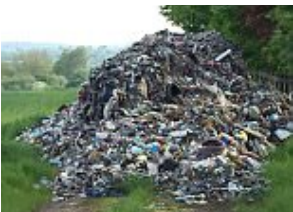
Scents of humour! Fly-tippers offload