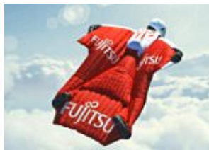
Real-life British Superman, 42, will