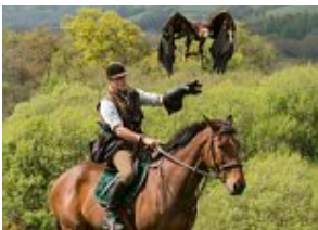
Britain's got talons! Rider and his golden