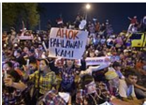
Jakarta's Christian governor jailed for